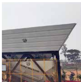
Heavy duty corrugated bins for longer life