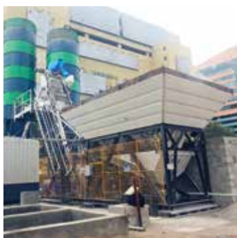
No foundation, No anchors, only PCC required