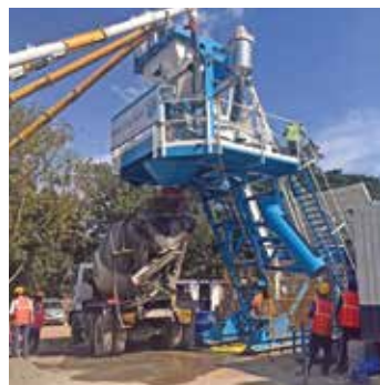
Cantilever design for easy vehicle movement