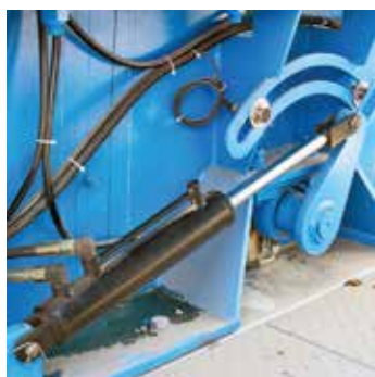
Mixer gate operation with hydraulic power pack