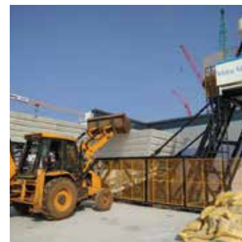
Low aggregate loading height