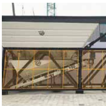
Safety mesh standard scope of supply