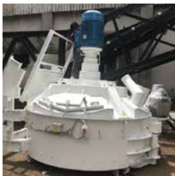
Simem own Planetary Mixers from 0.5m3 to 3m3 batch size.